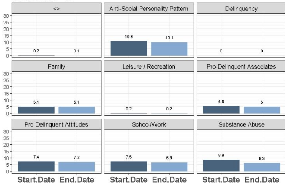
Central 8 Breakout For: Utah Youth Provider Dynamic.Risk, N = 10